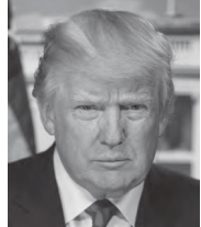
Trump / Vance