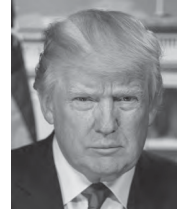
Donald J. Trump